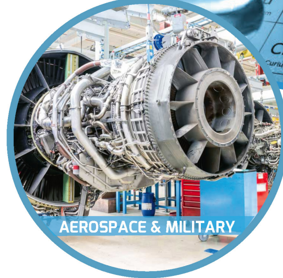
AEROSPACE & MILITARY

With its consolidated presence through 200+ distributors in more than 87 countries , Atomes is a tried, tested and proven supplier of specialty chemicals and biotechnology products sold under Atomes brand or Private Labels.